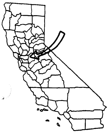
EXHIBIT B PRC 6445.1

CALENDAR PAGE 2 MINUTE PAGE 000022 000025