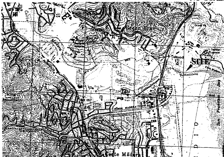
Exhibit A W25654 APN 023-021-18 Greenbrae MARIN COUNTY