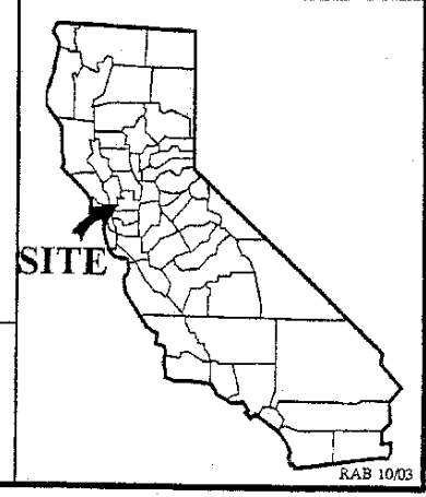
Exhibit A PRC 8486.1 SFPP, LP SOLANO and CONTRA COSTA COUNTIES