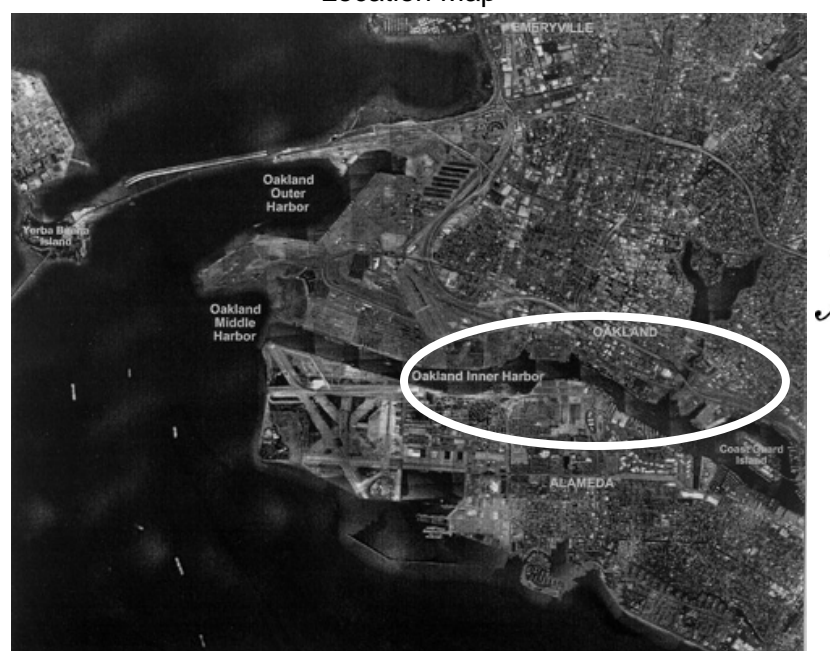
This exhibit is solely for purposes of generally defining the lease premises, is based on unverified information provided by the Lessee or other parties, and is not intended to be, nor shall it be construed as a waiver or limitation of any State interest in the subject or any other property.