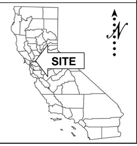
Exhibit A PRC 7757 Suisun City Marina Suisun Slough Solano County

This exhibit is solely for purposes of generally defining the lease premises, is based on unverified information provided by the Lessee or other parties, and is not intended to be, nor shall it be construed as a waiver or limitation of any State interest in the subject or any other property.