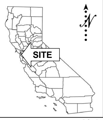
Exhibit A PRC 6759 BAE SYSTEMS SAN FRANCISCO COUNTY