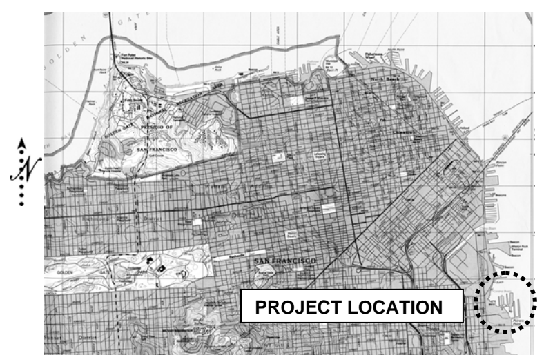
This exhibit is solely for purposes of generally defining the lease premises, is based on unverified information provided by the Lessee or other parties, and is not intended to be, nor shall it be construed as a waiver or limitation of any State interest in the subject or any other property.