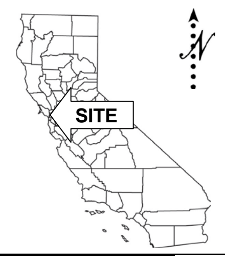
Exhibit A W 26330