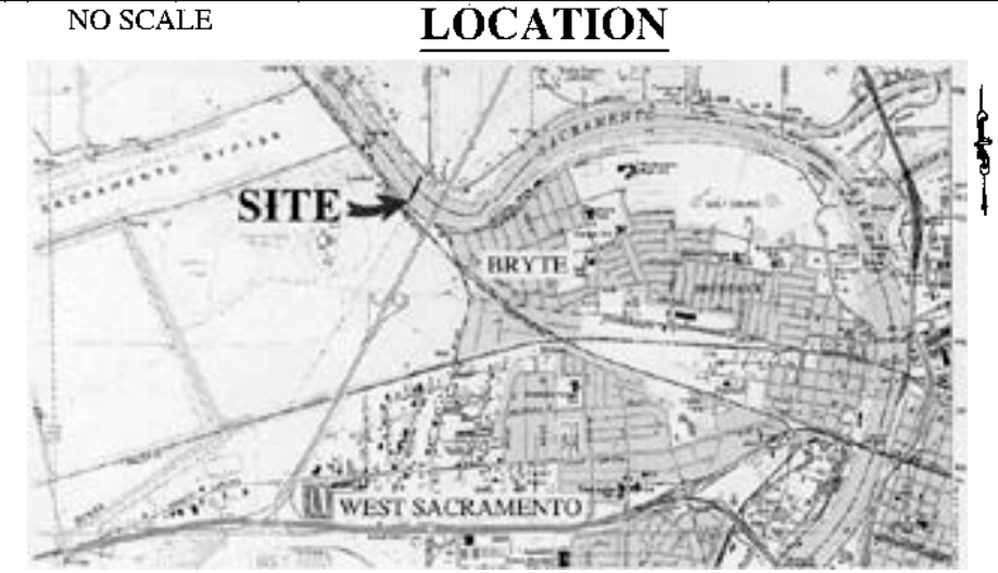
This Exhibit is solely for purposes of generally defining the lease premises, is based on unverified information provided by the Lessee or other parties and is not intended to be, nor shall it be construed as, a waiver or limitation of any State interest in the subject or any other property.