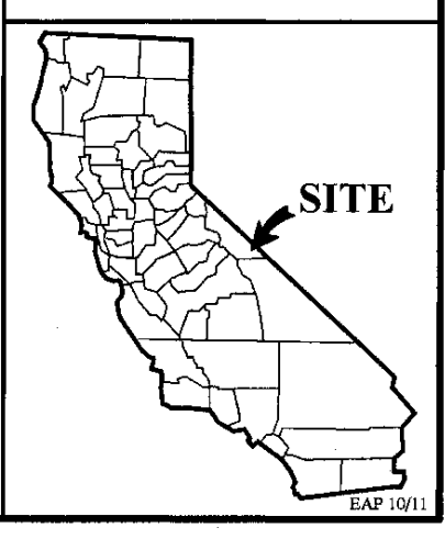
Exhibit B W 26511 CALIFORNIA BROADBAND COOPERATIVE GENERAL LEASE RIGHT-OF-WAY USE MONO COUNTY

This Exhibit is solely for purposes of generally defining the lease premises, is based on unverified information provided by the Lessee or other parties and is not intended to be, nor shall it be construed as, a waiver or limitation of any State interest in the subject or any other property.