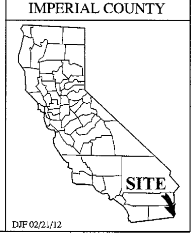
Exhibit B PRC 2344.1 IMPERIAL IRRIGATION DISTRICT GENERAL LEASE RIGHT-OF-WAY USE