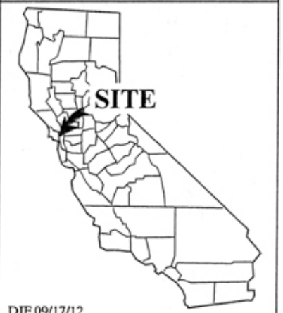
Exhibit B W 26571 PORTO BELLO ASSOCIATION GENERAL LEASE - DREDGING MARIN COUNTY

This Exhibit is solely for purposes of generally defining the lease premises, is based on unverified information provided by the Lessee or other parties and is not intended to be, nor shall it be construed as, a waiver or limitation of any State interest in the subject or any other property.