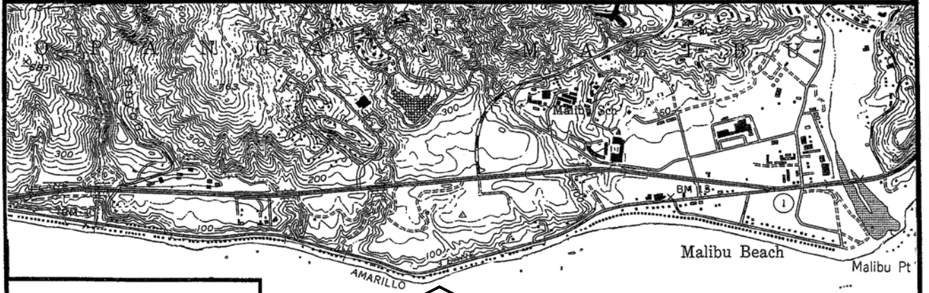
Exhibit A W24665 Tract 13157 Lots 14,15,16, & 17