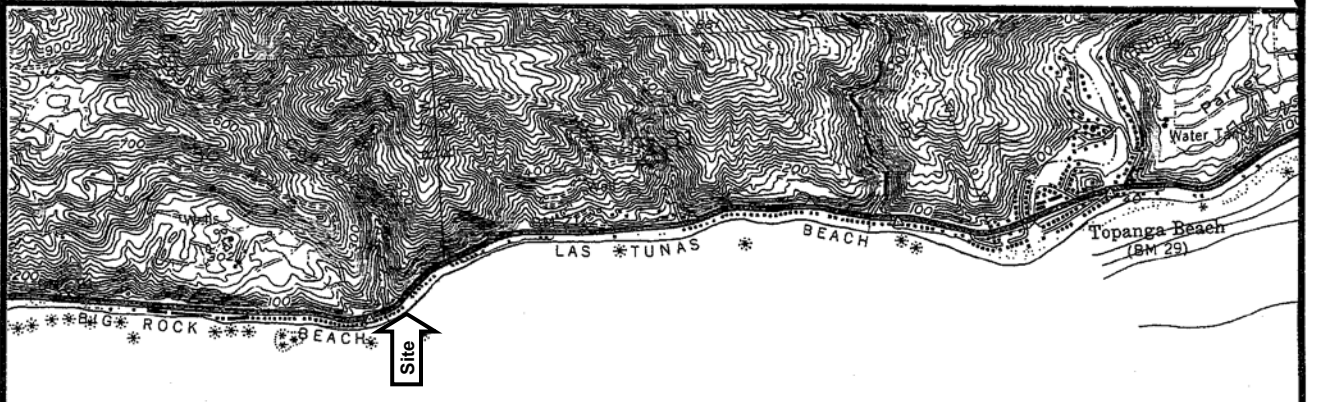
Exhibit A W24665 19906 Pacific Coast Highway