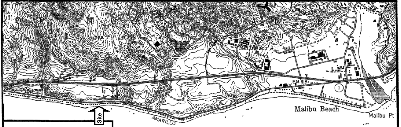
Exhibit A W24665 24848 Malibu Road