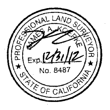
Page 1 of 2

Prepared January 9, 2012 by the California State Lands Commission Boundary Unit.