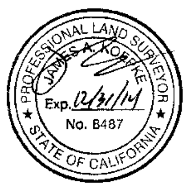
Page 1 of 2

Prepared 08/21/2012 by the California State Lands Commission Boundary Unit.