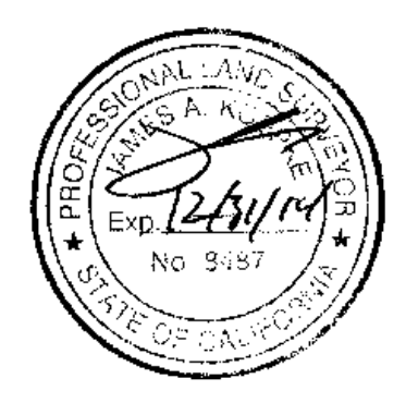
Page 1 of 2

Prepared 11/07/2013 by the California State Lands Commission Boundary Unit.