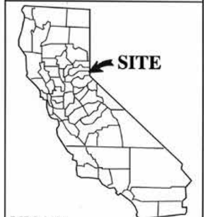
Exhibit A PRC 653.1 OBEXERS AND SON, INC APN 097-154-001 GENERAL LEASE - COMMERCIAL USE PLACER COUNTY