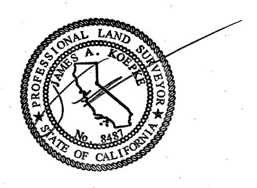
Page 1 of 2

Prepared 07/06/2018 by the California State Lands Commission Boundary Unit